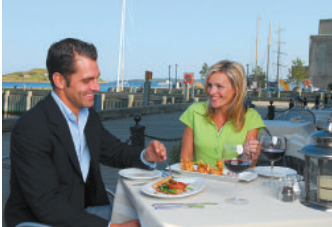
Dining on the waterfront boardwalk.