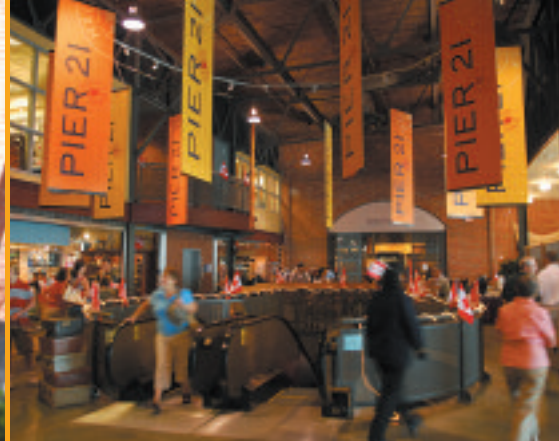
Pier 21 National Historic Site