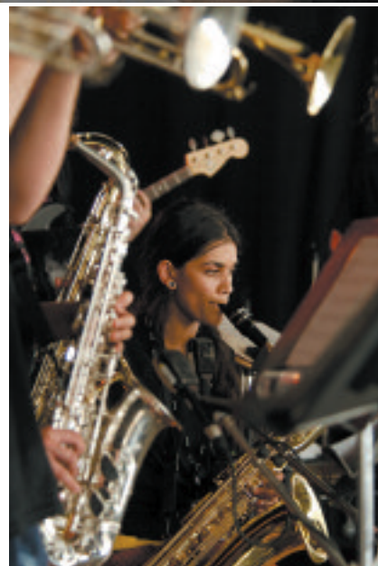
Atlantic Jazz Festival, Halifax

The growing community of Fall River offers accommodations, service stations and a variety of shops. On the right is the Old Guysborough Road, 3 km (2 mi.) from the