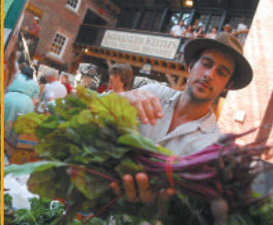
Halifax Farmers' Market