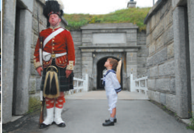
Halifax Citadel National Historic Site.

seafaring life. The museum proudly displays over 20,000 maritime artifacts. Be sure to visit the displays commemorating the catastrophes of the Halifax Explosion and the “unsinkable” Titanic .