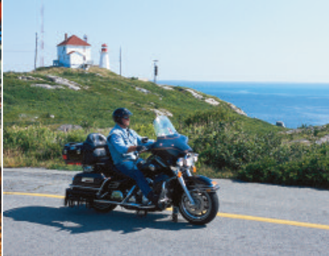
Touring at Chebucto Head

been a haven of meandering paths, sun-kissed fountains, lively duck ponds and formal Victorian flower beds.