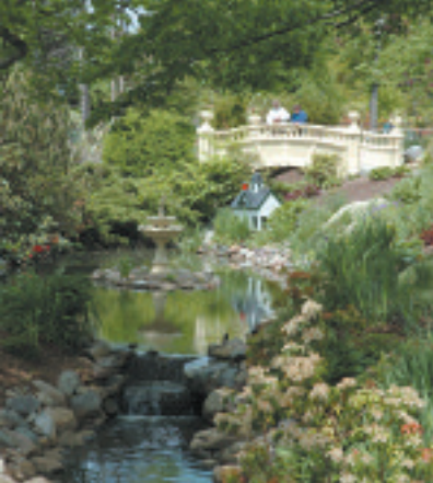
The Halifax Public Gardens