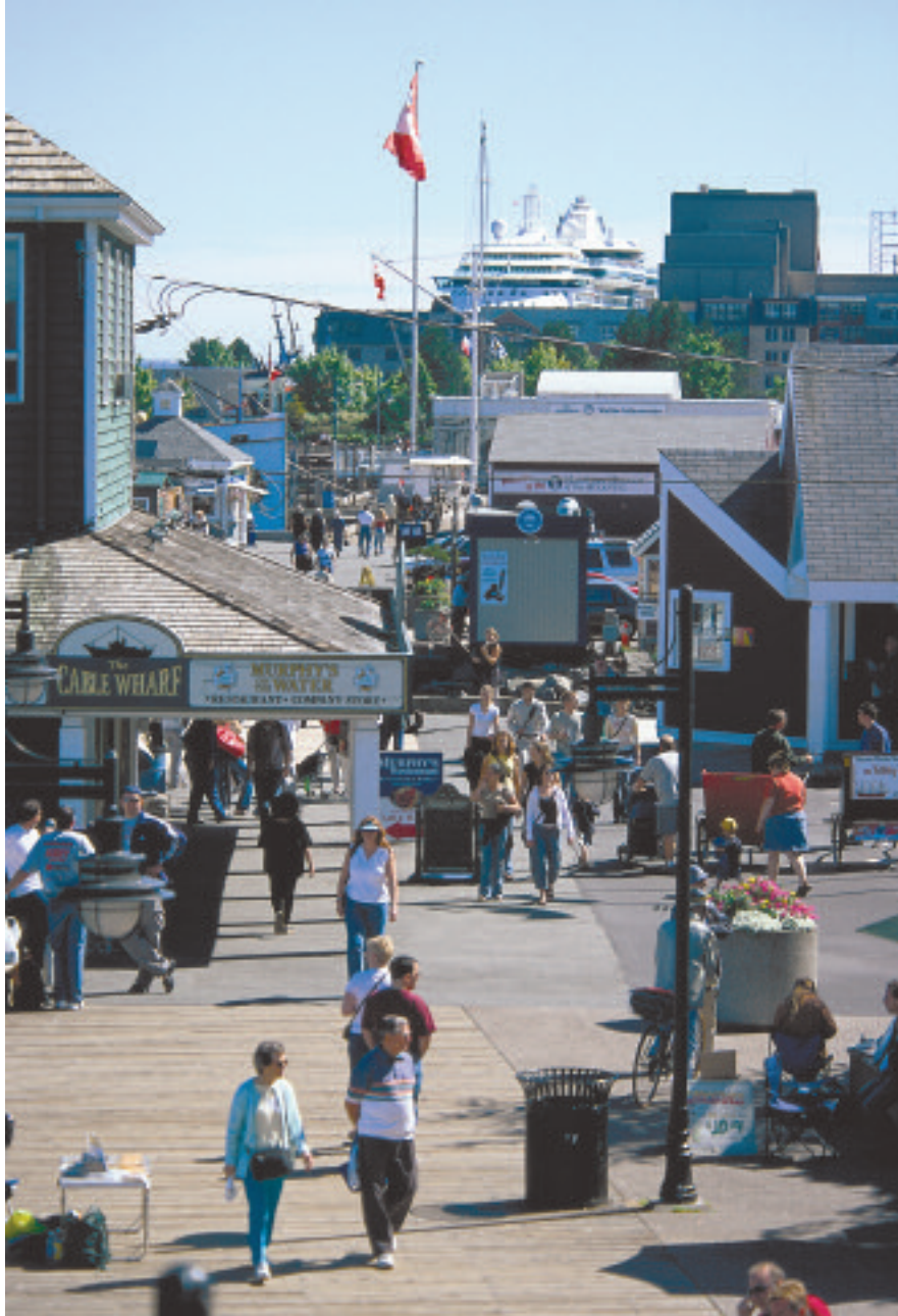
Halifax boardwalk is always busy with activity.

Crossing the harbour on the ferry is a wonderful way to view the beautiful waterfronts of both cities. Visit the restored Historic Quaker House, the oldest house in Dartmouth. The Shubenacadie Canal Park invites nature lovers to stroll quiet, sun-dappled paths along the Shubenacadie Canal, the ambitious canal system that once linked Halifax with the Bay of Fundy.