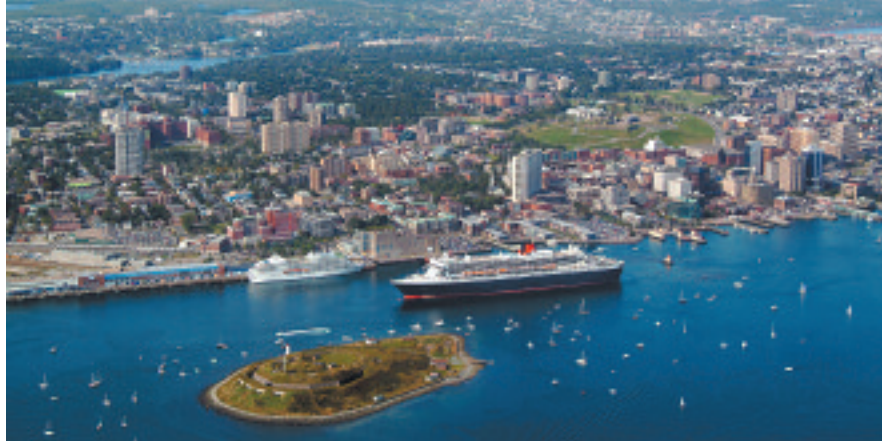
The Queen Mary II visits Halifax Harbour.

noon-day gun is a Halifax tradition dating from the late 1800s. (See p. 83.)