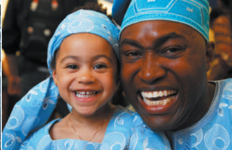
Learn about Nova Scotia's black heritage at the Black Cultural Centre.

lakes provide opportunities for kayaking, windsurfing, canoeing and swimming. Lake Banook is a world-class paddling course, where weekly and championship regattas are held. Dartmouth features many parks and walking trails and easy access to the unspoiled coastal beauty of the Eastern Shore.