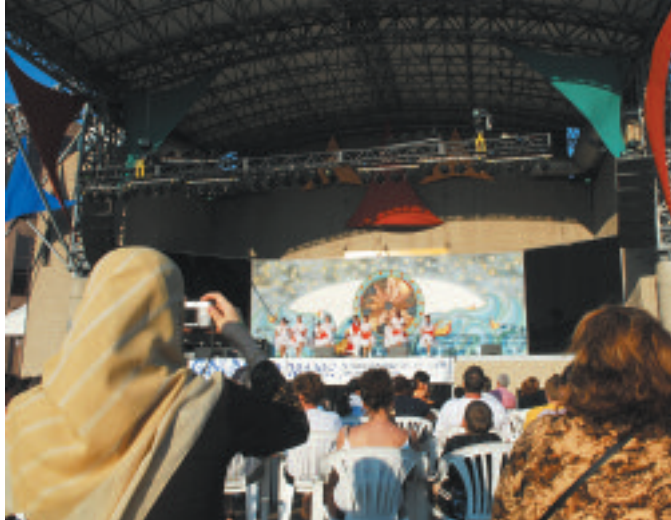
The annual Multicultural Festival on the Dartmouth waterfront.