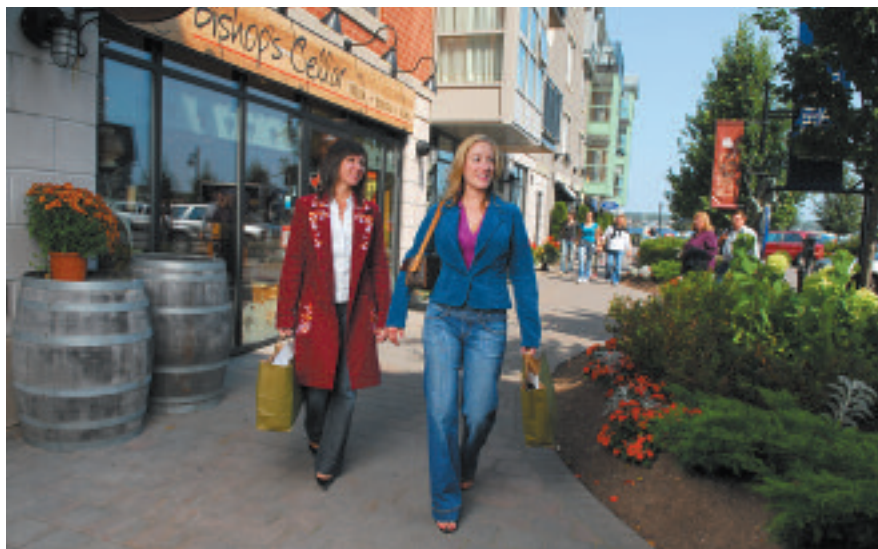
Halifax is known for its great shopping.