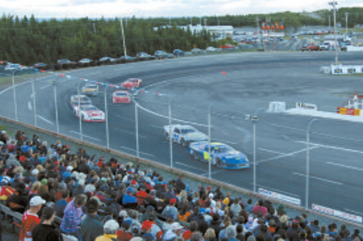
Pro stock racing series at Scotia Speed World